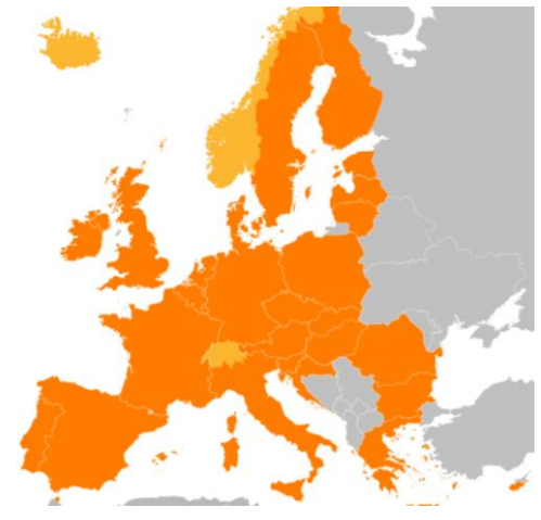
Figure 1. Eurodac users

Public statistics can be accessed on eu-LISA's website.