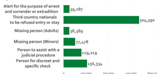
Figure 2. Alerts on persons (2018)